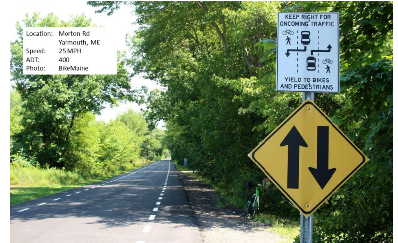
Test ELR Yarmouth, ME