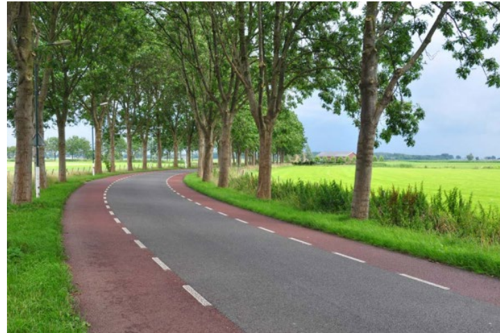
Rural ELR, Amsterdam